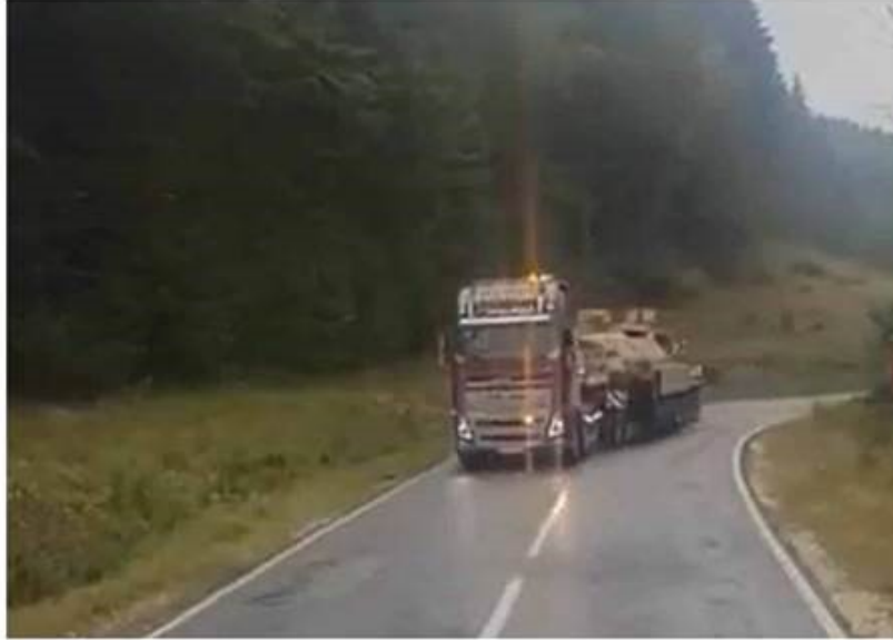
Avia Pro: American tanks seen near the border with Ukraine.

The US has begun moving its heavy tanks and light armored vehicles to the border with Ukraine, apparently preparing to use these vehicles to attack Russia. How exactly the tanks and other armored vehicles of the US Armed Forces got into the territory of Romania is unknown, however, it is alleged that the equipment is being transferred towards the Ukrainian border very intensively.