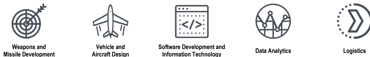
Figure 1. Targeted Industries